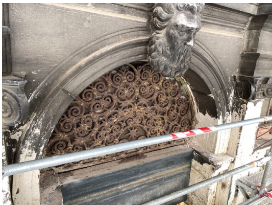
Window grilles from the 8th century

Measurements made in cooperation with the responsible authorities, the Soprintendenza, and the monument preservation authorities, indicated that the entire facade was unstable and was threatening to topple over. Signs of the movement of the building were also visible in cracks in the parquet in the interior of the palazzo. The aim of the restoration measures is to prevent a possible collapse of the building and to save the palazzo, from a static point of view, for coming centuries. In the course of this work, the historical building substance is to be revised and construction sins of the past removed.