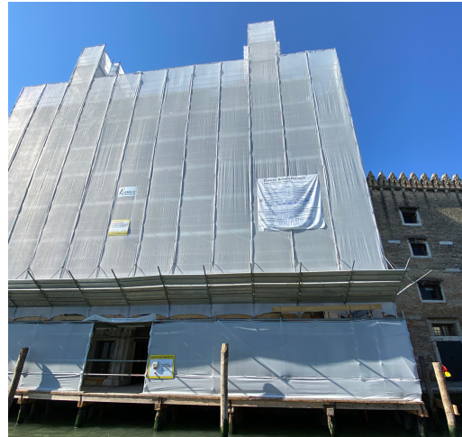
Scaffolding at Palazzo Belloni Battagia on the Canale Grande

When The European Heritage Project acquired the 17th-century palazzo on the Grand Canal, it was clearly visible that extensive restoration and renovation measures were required to restore the splendour of bygone days. The building has now been completely surrounded by scaffolding to carry out work on the facade.