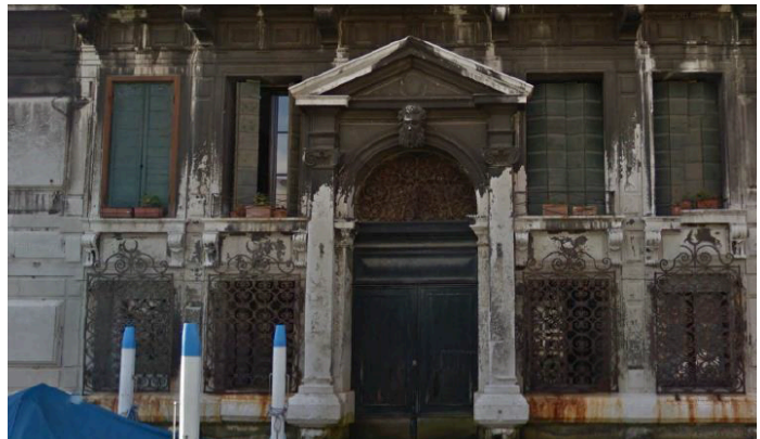
Current state of the façade

The elaborately manufactured window grates from the 18th century require extensive restoration. Decades worth of rust has damaged the material and endangers the substance and stability of the ancient cultural artefacts. Missing window grates are to be replaced.