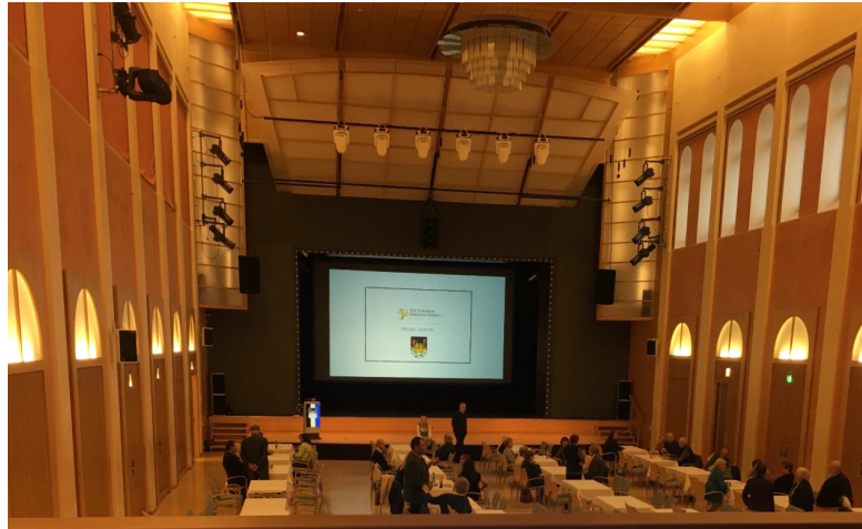
The large hall of the Congress- und Theater House before the Information event

The plans to revitalise the marketplace in Lauffen had already been presented to the parliamentary party leaders in Bad Ischl in May. In a subsequent information event at the Bad Ischl Congress and Theater House, the people of Lauffen were also informed about the plans and asked to submit their own suggestions for the design. This event met with a great response - over 150 Lauffner residents took part.